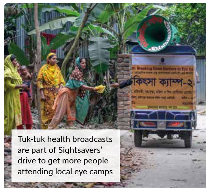
Tuk-tuk health broadcasts are part of Sightsavers’ drive to get more people attending local eye camps

To find out more about this special way of giving, visit: www.sightsavers.org/legacy