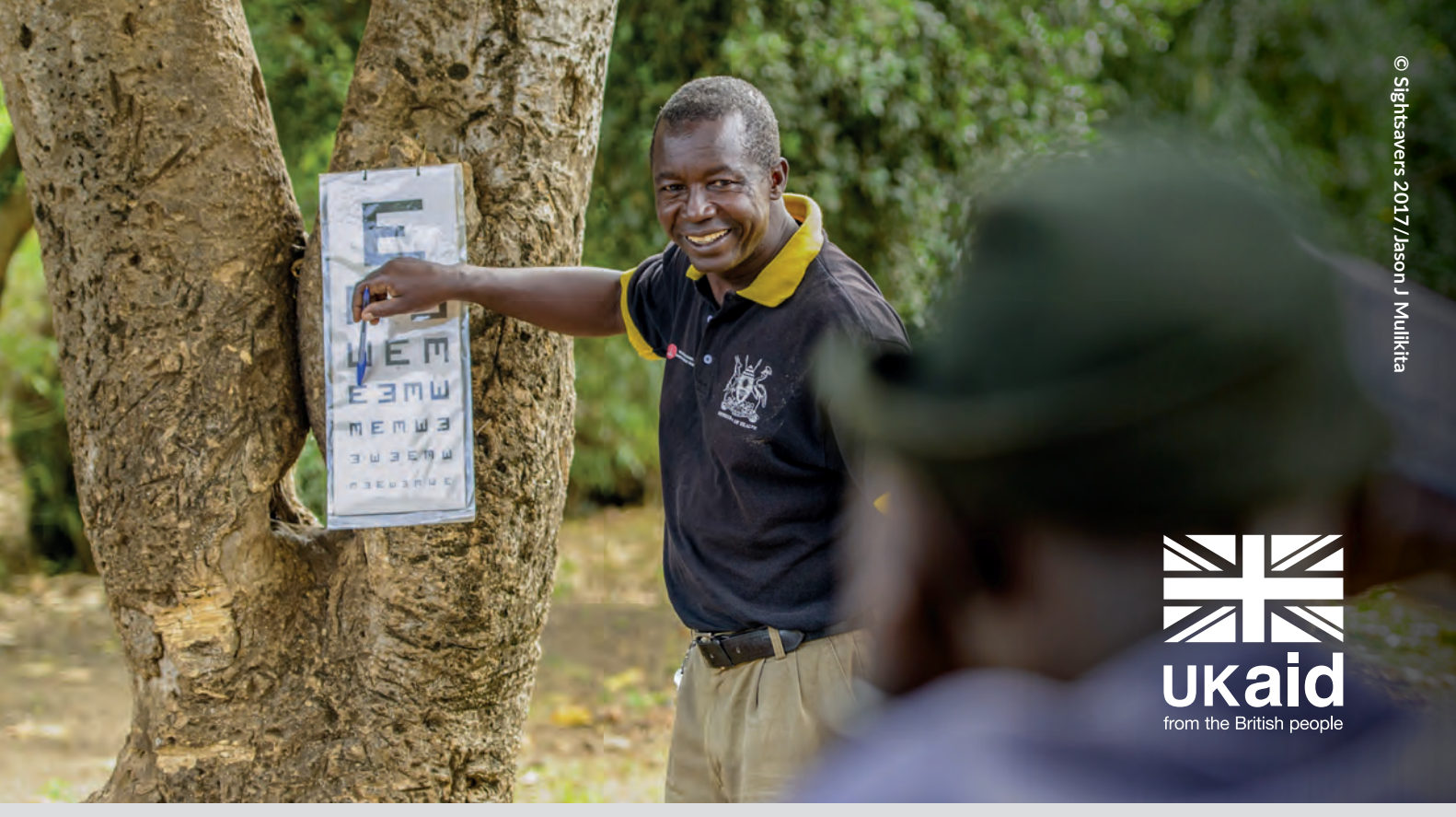
Eye test at a screening site in Kangole, Moroto, eastern Uganda.